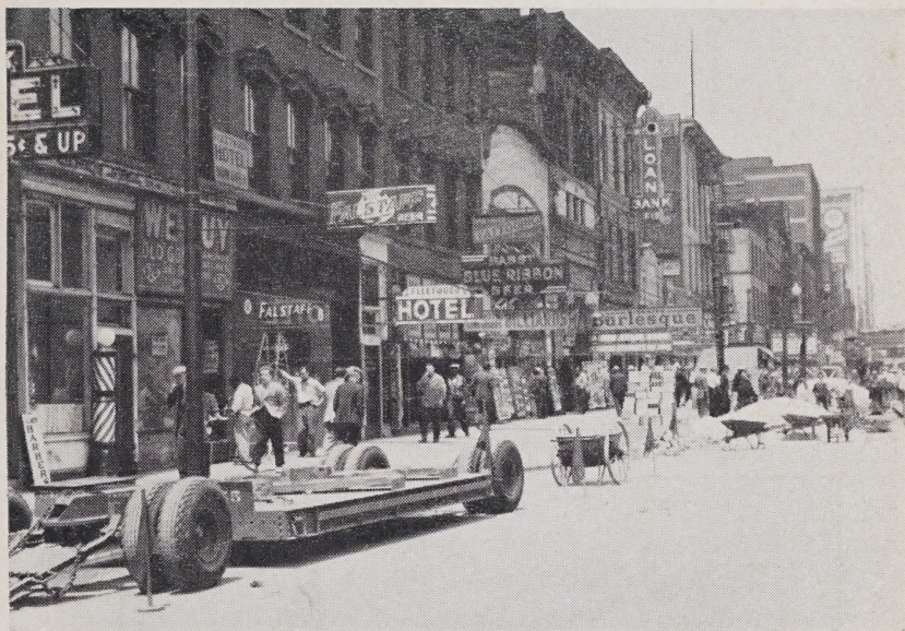
Chicago's Ill-Famed State Street