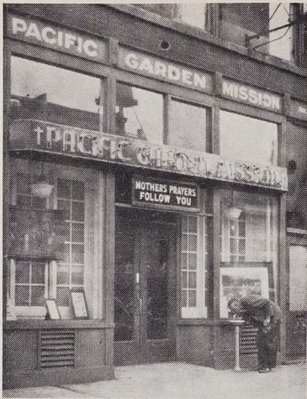
"Doorway to Heaven"