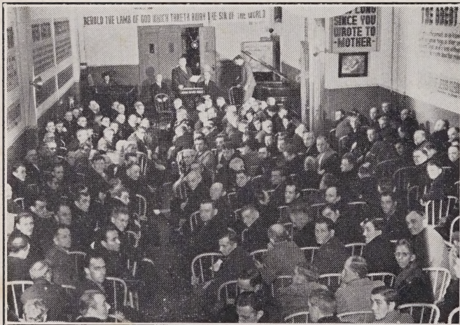
Interior of the "P. G." Mission